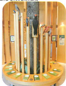
Display of an actual tree : Betula maximowicziana, (Monarch Birch); Diameter 1.2 m