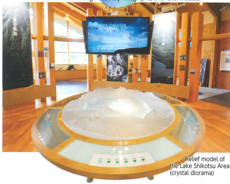
Relief model of the Lake Shikotsu Area (crystal diorama)

The history and highlights of the Lake Shikotsu area are introduced through videos, photographs, and relief models.