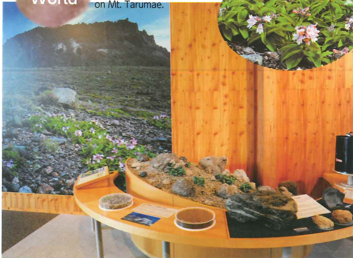
Tarumaiso (Pennellianthus frutescens)

Plants that have adapted to the harsh weather conditions on Mt. Tarumae.