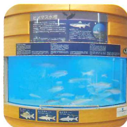
Kokanee (Himemasu) Aquarium